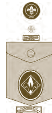
LEFT POCKET, (TAN SHIRT)