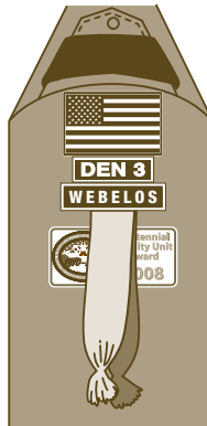
WITH DEN EMBLEM