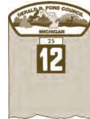
OPTIONS FOR LEFT SLEEVE