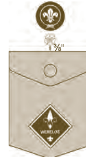
LEFT POCKET, NAVY BLUE OR TAN SHIRT