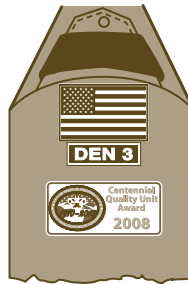
WITH DEN NUMERAL